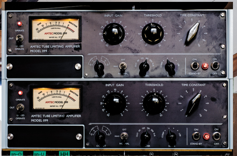
A pair of Amtec 099 valve limiters.