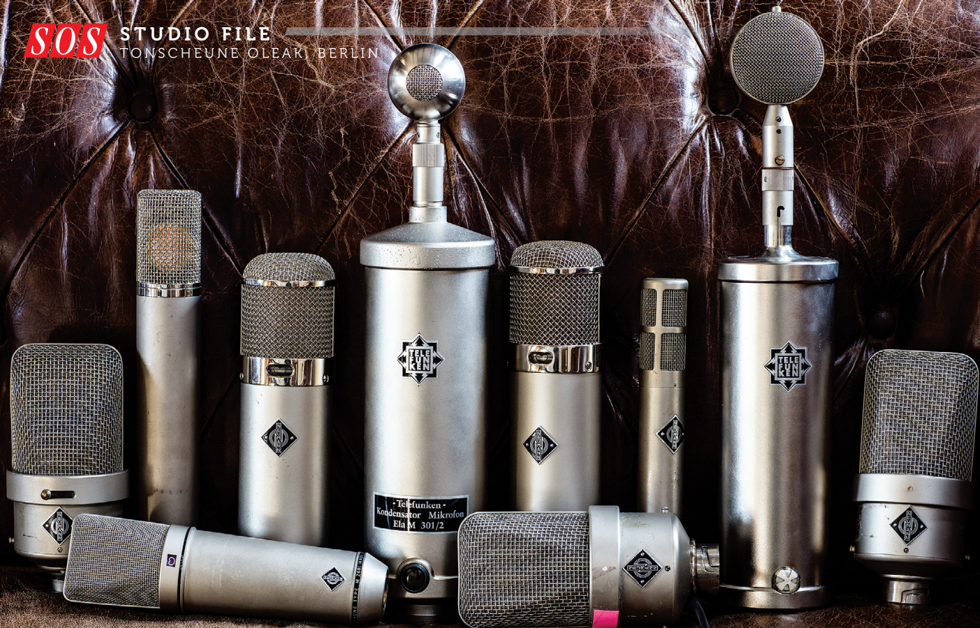
The microphone collection includes many vintage classics.

» He studied electronic engineering and room acoustics in Dresden in the mid-'70s, and piano, composition and arrangement in East Berlin in the mid-'80s. Since then, Oleak has composed and produced hundreds of soundtracks for films and television shows, music for ballet, for olympic figure skater Katarina Witt, and he also worked with numerous pop artists, including East German rock legends Puhdys, Silly and Karat.